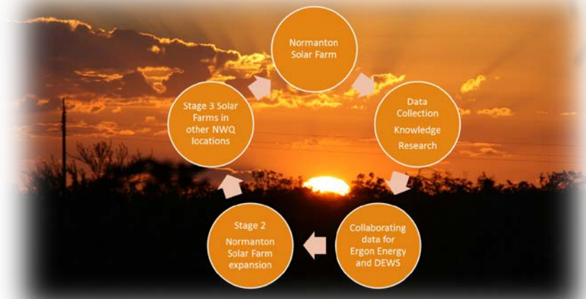
Figure 3 – Knowledge sharing will benefit future solar projects in North West Queensland