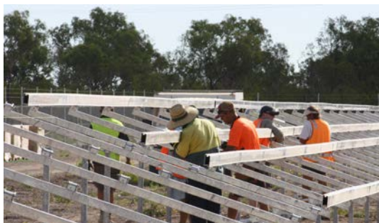
The Scouller Energy crew assembling the racking on site in Normanton