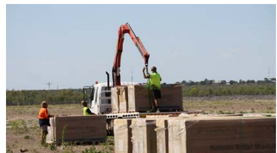
The 16,000 solar panels were supplied by Canadian Solar